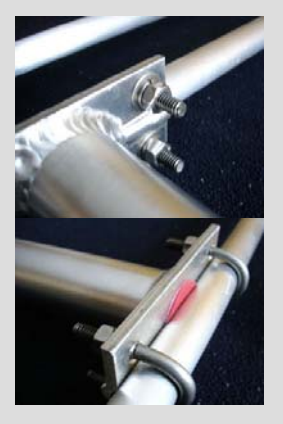
Heavy-duty dipole fixture