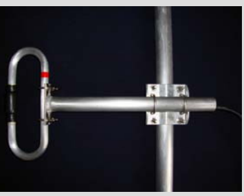
1/2 - wave spacing (3 - 3.7 dBd gain) (Bi-directional / Elliptical pattern)