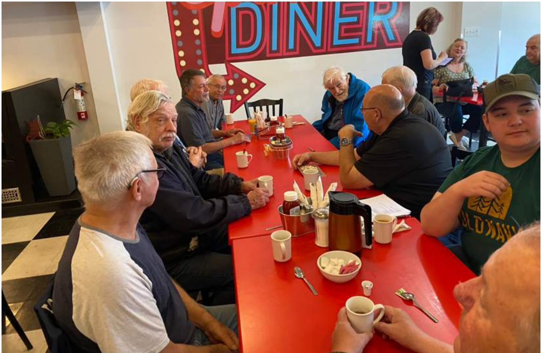
May 13 FULL HOUSE