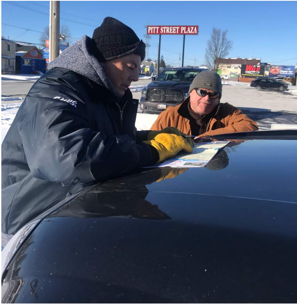
I think we are close...(hummm?)